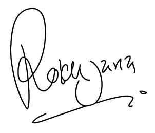
Rokhsana Fiaz Mayor of Newham

All these efforts will allow Newham's economic potential to be unleashed.